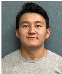
Eldos Orozobekov Store