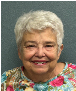
Adele La Buhn Store