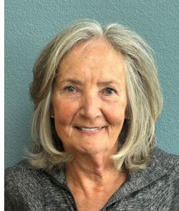
Sally Goodman Store